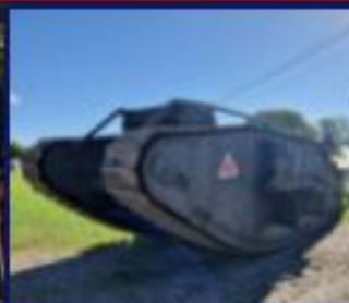
MILITARY VEHICLES, BUSES & HELICOPTERS