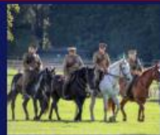
LIVING HISTORY RE-ENACTORS & HORSES ARENA DISPLAYS