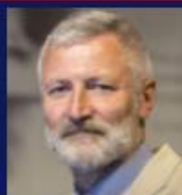
SPEAKERS & MILITARY AUTHORS SIGNING SELLING & TALKS