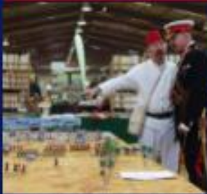
WARGAMERS & MODEL MAKERS DISPLAY, PLAY & TRADE STANDS

More than just a Military Show. "Its like someone emptied their toybox and it all came to life! "