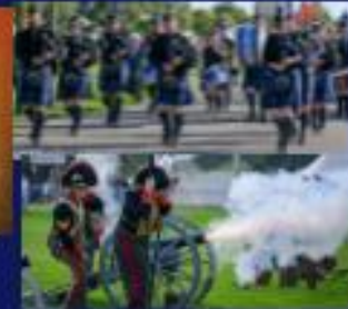
Music, Activities, Marching Bands Hands on History And so much more!