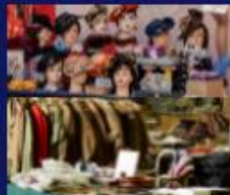
INDOOR & OUTDOOR TRADE STANDS MILITARY, HISTORICAL & HERITAGE, ARTISAN FOOD & DRINK & RE-ENACTOR GOODS FOR SALE